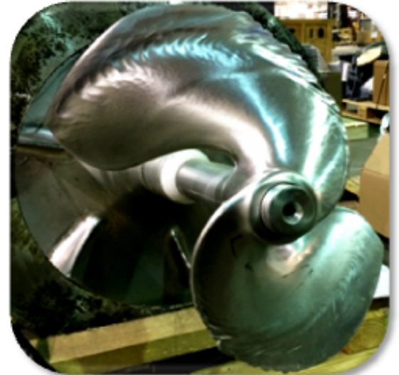
Prop Damage: One of the Leading Causes of Motor Failure, and a Reason to Purchase a "Good As New" Power Section

After receiving your diffusion head or motor base, Aqua-Aerobic will rebuild the power section (not including the float) with a new Endura® Series high-efficiency motor. We will also include a new precision propeller, shaft parts, and perform a vibration balance check to ensure "Good As New" quality.