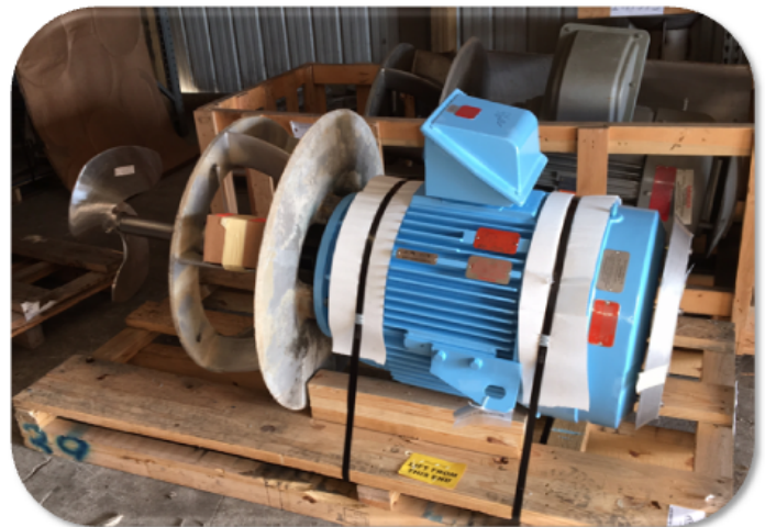
"Good As New" Aqua-Jet® Aerator Power Section