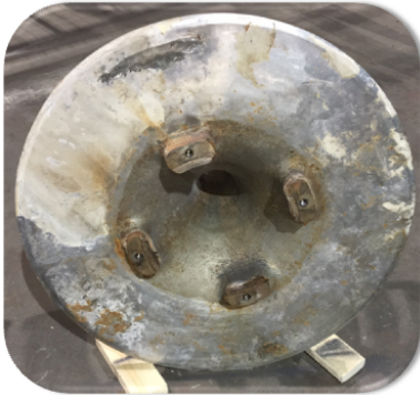
Customer-Supplied Diffusion Head

Simply contact your Aqua-Aerobic Aftermarket Service Representative and arrange to have your existing diffusion head or motor base shipped to us. We will issue you a return authorization number for shipping from your site to ours while covering the cost of freight. You can send your complete power section for Aqua-Aerobic to disassemble.