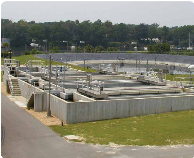
Four AquaABF ® concrete filters installed as part of this plant's upgrade to meet required effluent TSS and phosphorus levels.

AquaABF concrete filters are available in standard widths of 6, 9, 12.5, and 16 ft. (1.8, 2.7, 3.8 and 4.9 m), offering site adaptability and cost efficiency.