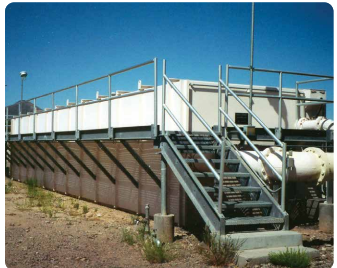
AquaABF ® package filters are ideal for both municipal and industrial water or wastewater treatment applications.

AquaABF package filters are available in a range of sizes from 4 ft. x 8 ft. (1.2 m x 2.4 m) to 9 ft. x 40 ft. (2.7 m x 12.2 m), and are available in both painted steel and stainless steel.