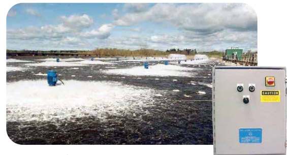
Aqua-Jet® aerator and typical definite purpose control panel

Applications include: Aqua-Aerobic batch reactor systems, phased activated sludge systems, cloth media filters, membrane systems, aeration control, and plant-wide auxiliary systems.