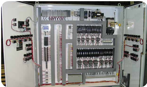
Configurations for custom applications

Applications include: Aqua-Aerobic batch reactor systems, phased activated sludge systems, cloth media filters, membrane systems, aeration control, and plant-wide auxiliary systems.