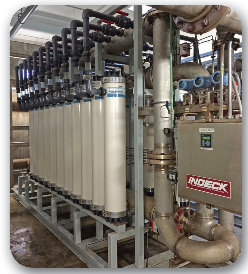
(1) Aqua MultiBore® Membranes module in Train 2.

In April 2014, Butler decided to conduct a 9-month pilot study with (21) Aqua MultiBore<sup>®</sup> membrane modules retrofitted into Train 2. Train 2 was tested alongside the other (3) UF trains and proved the superior performance