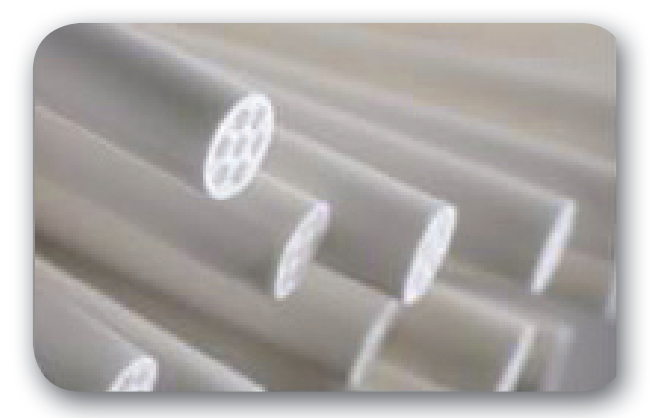
Aqua MultiBore® membrane fibers.