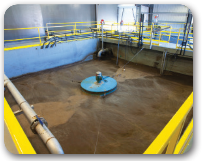
One of Quechan Casino's batch biological reactors.

was expected to go from < 2% to nearly 100% capacity in one day! Because of Aqua-Aerobic Systems' unique, early startup plan, Quechan Casino avoided the large expense of hauling seed-sludge.