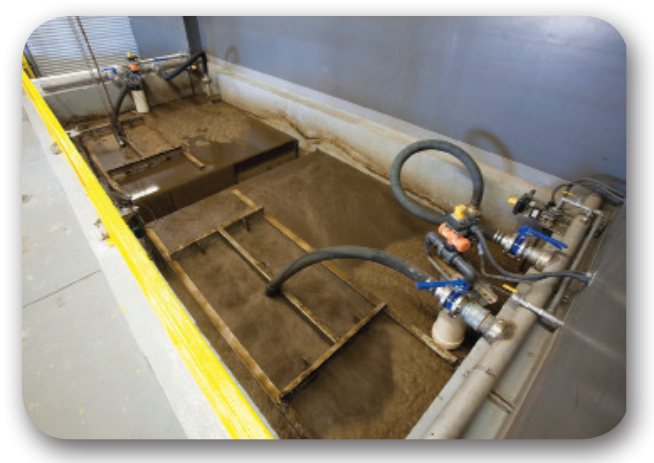
Quechan Casino's membrane module in air scour mode.

The system was actually started up a month before the casino opened in order to get the biomass to necessary levels for treatment of the Grand Opening flows. The flow