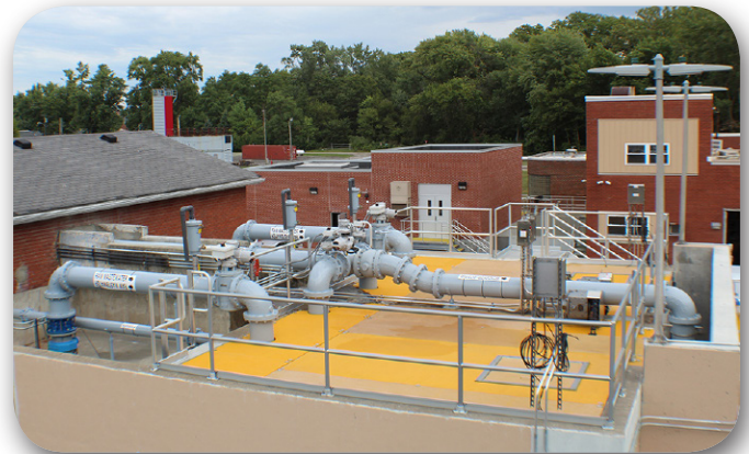
Covered AquaStorm™ cloth media filters were retrofitted into the abandoned sand media filter structures.

Rushville's new tertiary/wet weather filtration system also included replacement of its existing gas chlorine disinfection system with a UV disinfection system. The UV system was installed in the existing tank, which also provided significant project cost savings.