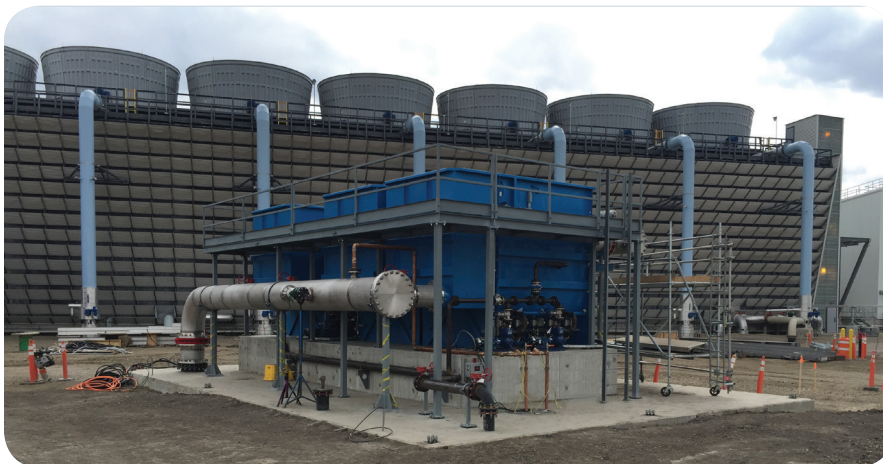
Overview of the (3) 8-disk AquaDisk® filter units located adjacent to Shepard Energy Centre's cooling towers.

Enmax and Capital Power chose to install (3) 8-disk AquaDisk® cloth media filter units to help in this process. Effluent from the Bonnybrook Wastewater Treatment Plant is pumped through a 9 mile long pipe to the Shepard Energy Centre. Water then passes through the (3) AquaDisk cloth media filters before being sent to the cooling tower. Filtration is key in preventing solids accumulation in the cooling tower.