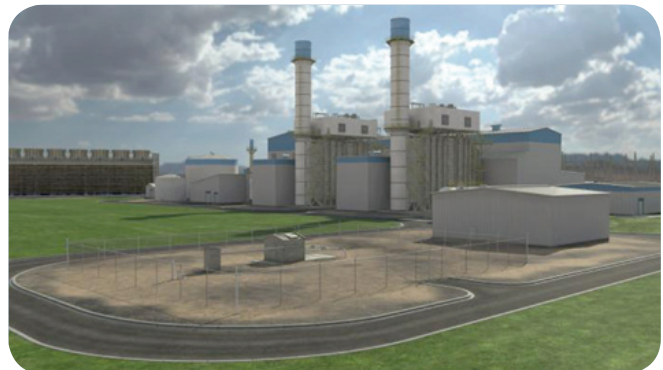
Overview of the Shepard Energy Centre.