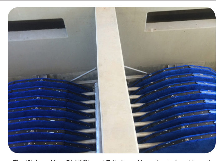
The (2) Aqua MegaDisk® filters at Talladega, AL are located next to each other in concrete tanks.